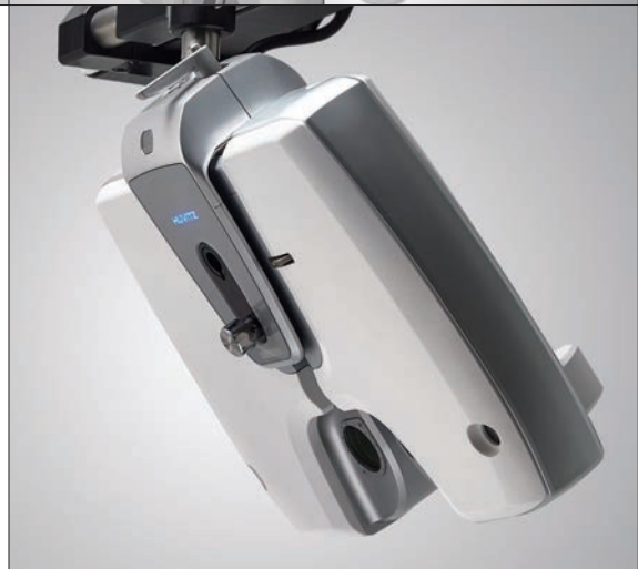
Tiltable Refractor Body

Slimmer design even prevents minimum mechanical interference during exam and enables easy monitoring over patients.