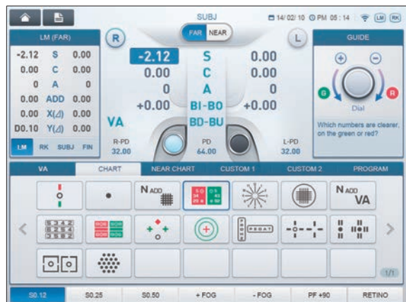
Various Charts / Real Time Guide